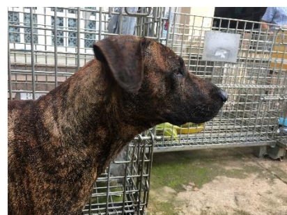
Figure 1. Some primary dog coat colours with the brindle phenotype (top) and characteristics of the brindle dog (bottom)